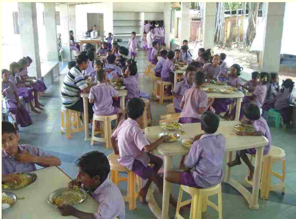
'Priyannam' in action, with grateful thanks to the ones who enabled this..!

As for the school's very much needed expansion, our next daring step is towards a library-cum-media building for which we have received already Rs 13 lakhs (€19,225; $30,385), which is enough to complete one section. The total cost is Rs 30 lakhs (€44,776; $70.126), but we will only seek those funds, when we have enough to cover our running costs.