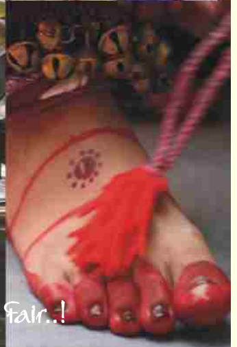
Glimpses of the Pep-Rally Fair..!